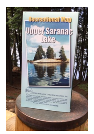
USL Map $5