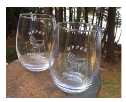
15 oz. Etched Wine Glasses $8 each or Set of 4 for $30