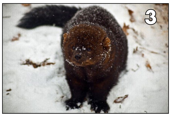
Fisher — Tracks near glove