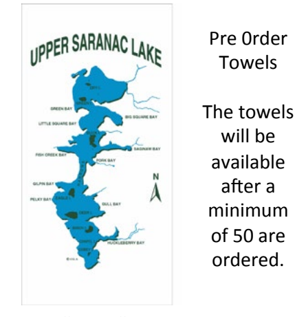
30" x 60" Towel (10.5 lb.) $30

All prices include tax. Cash or check only; checks to be made out to USLA Scholarship Fund. Email orders to <u>uslastore@gmail.com</u>. Include size, quantity, name and phone number. Pick up or local delivery available.