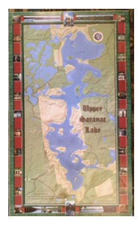
22" x 37" Map Poster $10