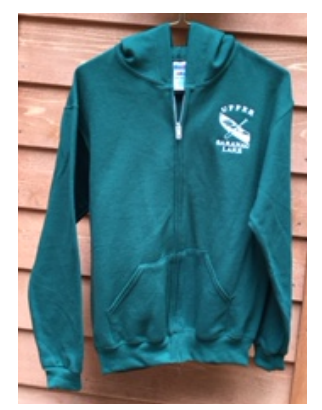
Youth Hoodies (Green Canoe only) S, M and L sizes $30