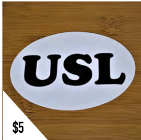
USL CAR DECAL