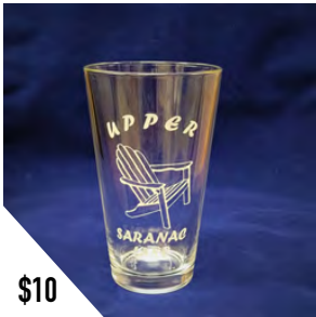
USLA BEER GLASSES