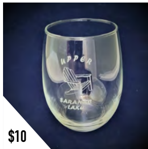
STEMLESS USL WINE GLASSES