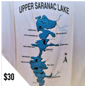
UPPER SARANAC LAKE BEACH TOWEL