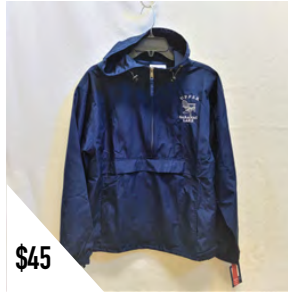
USL ADULT PACKABLE QUARTER-ZIP WINDBREAKER