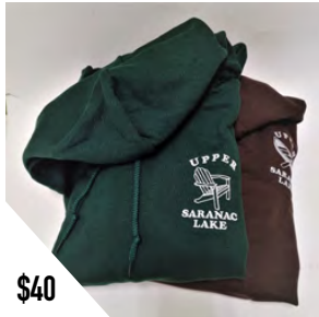
USL ADULT HOODED SWEATSHIRTS