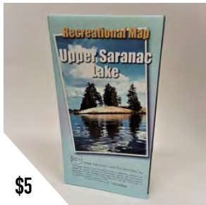
UPPER SARANAC LAKE RECREATIONAL MAP