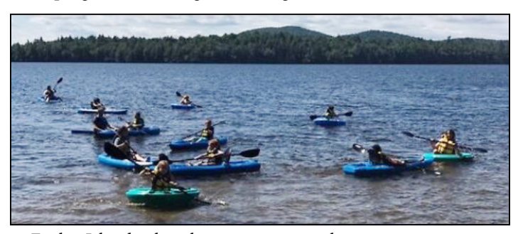
Eagle Island also has unique employment opportunities available. We are looking for enthusiastic candidates with outdoor, food service, maintenance, and water sport interests for Camp

After successful Day Camp, Overnight Camp, Family Camp, and Women's Weekend programs throughout the summer in 2021, Eagle Island Camp (EIC) is ready to welcome more campers back to the island with a full slate of programming! In addition to one week of All-Gender Day Camp for young people ages 7 to 11. we are planning four weeks of Girls' Overnight Camp for ages 9 to 15! We'll also have two sessions of Family Camp, and two August Women's Weekends. All programs allow campers and participants to experience the natural beauty of the island and the rich traditions of the camp, while making new friends, learning new skills, and having fun. Most importantly, youth campers will be able to spend time outdoors, unplug from electronic screens, and try new things! All youth camp weeks will once again include swim lessons, kayaking, canoeing, paddling, team-building, arts & crafts, and nature exploration. Sailing will also be available for some programs. Visit eagleisland.org for more details.