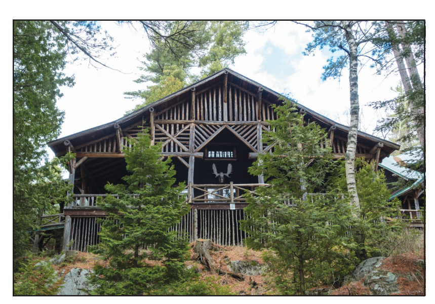
Shown here is a building on Eagle Island. The island in its

here in 1966, dressed for a skit near the camp's waterfront.