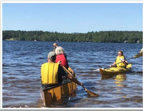
Some volunteers arrive on the pontoon boat, others prefer their own transportation