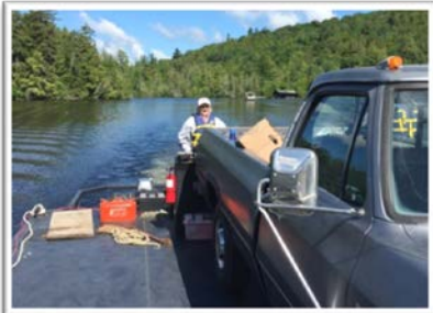
EI's "new-used" truck for the island making the journey